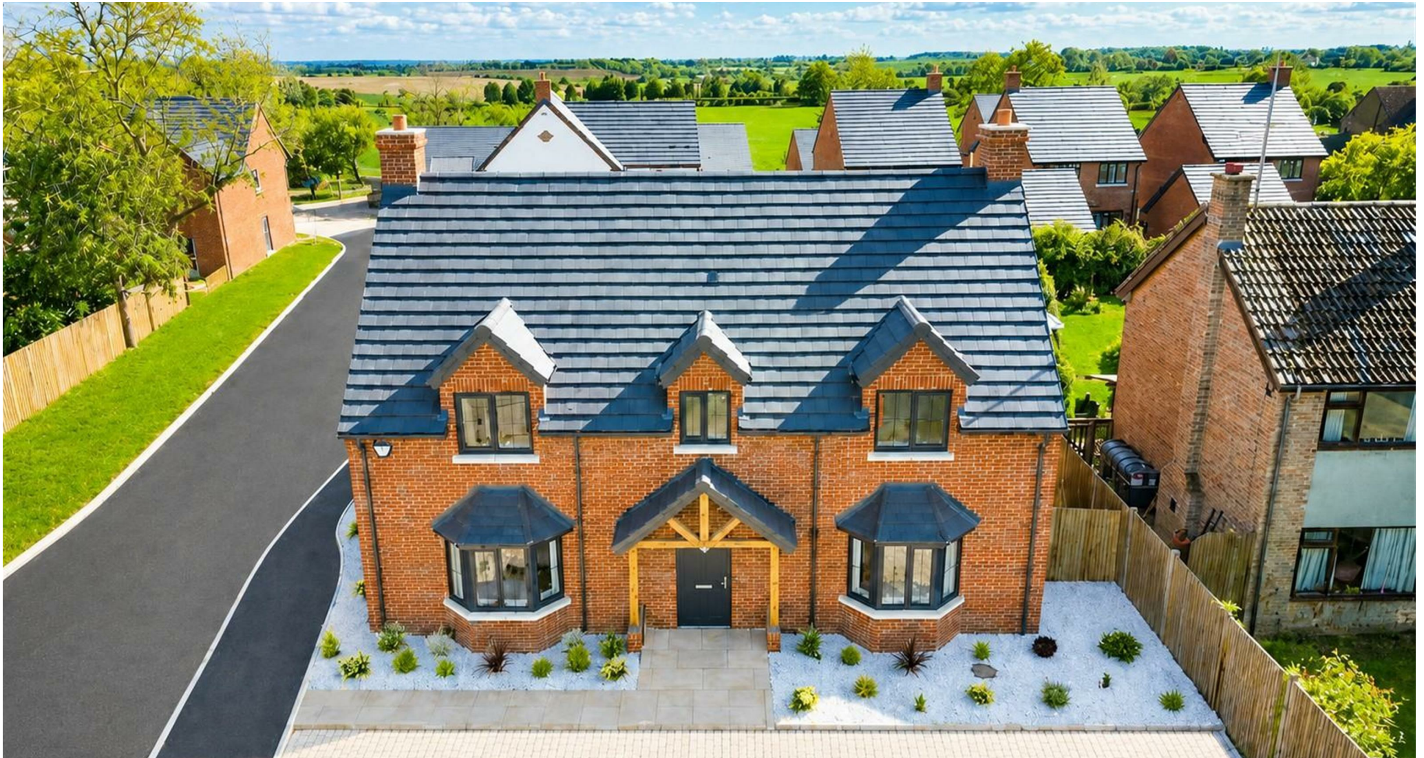
Plot 1 The Beeches, Highstreet, Thurleigh, Bedford, MK44 2DS £850,000 Freehold