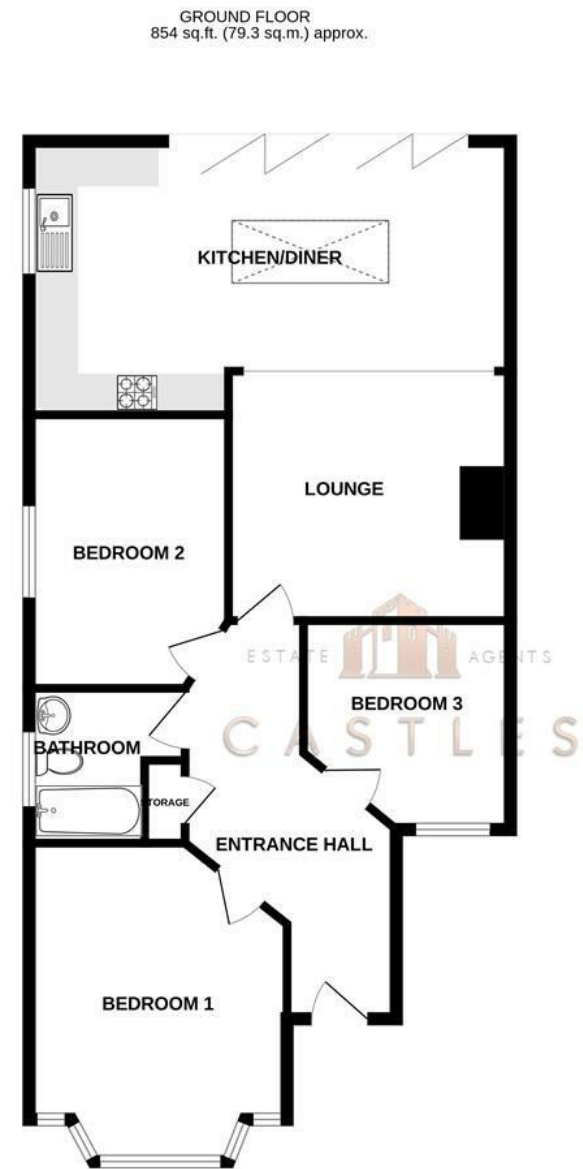
GROUND FLOOR 854 sq.ft. (79.3 sq.m.) approx.