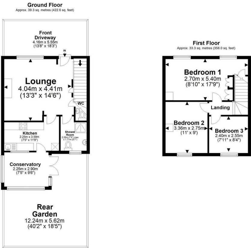
Total area: approx. 72.5 sq. metres (780.5 sq. feet) All images used are for illustrative purposes only. Floor plans are intended to give a general indication of the proposed layout only. All images and dimensions are not intended to form part of any contract or warranty. This floor plan has been prepared exclusively for the use of Maxwell Estate Ltd. Plan produced using PlanUp.