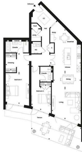
Sunningdale Park, The Pavilion - Property 1, Ground Floor