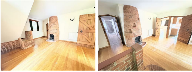
Lounge/Diner 29'2 max x 15'11 max (8.89m max x 4.85m max)