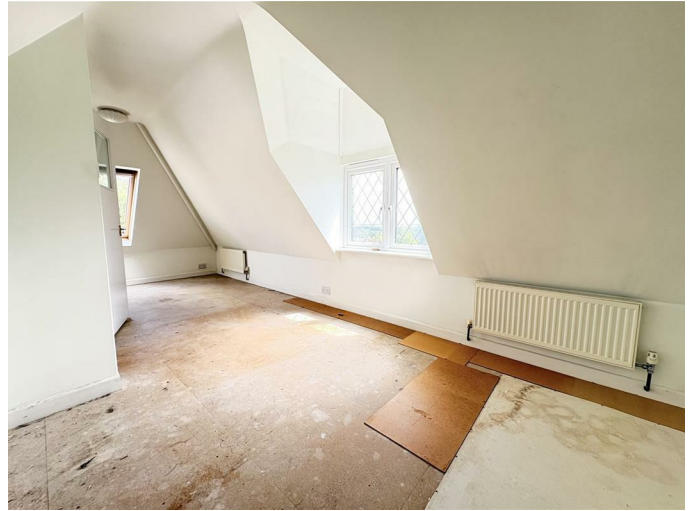
Bedroom Four 20'8 x 11'0 (restricted head room) (6.30m x 3.35m (restricted head room))