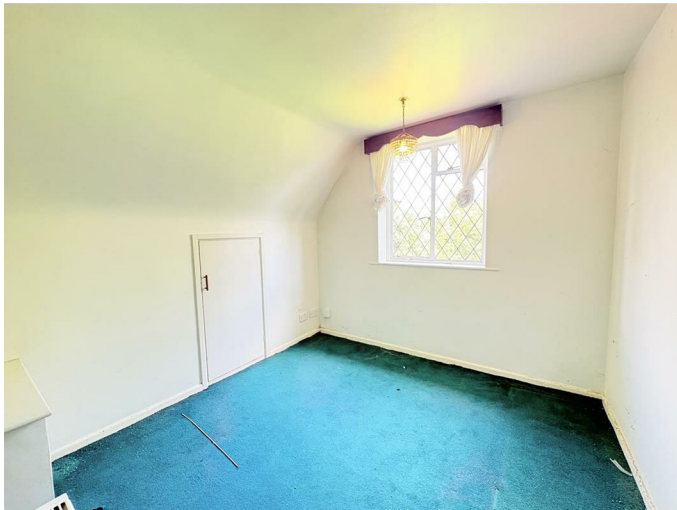
Bedroom Three 9'4 x 9'0 (2.84m x 2.74m)