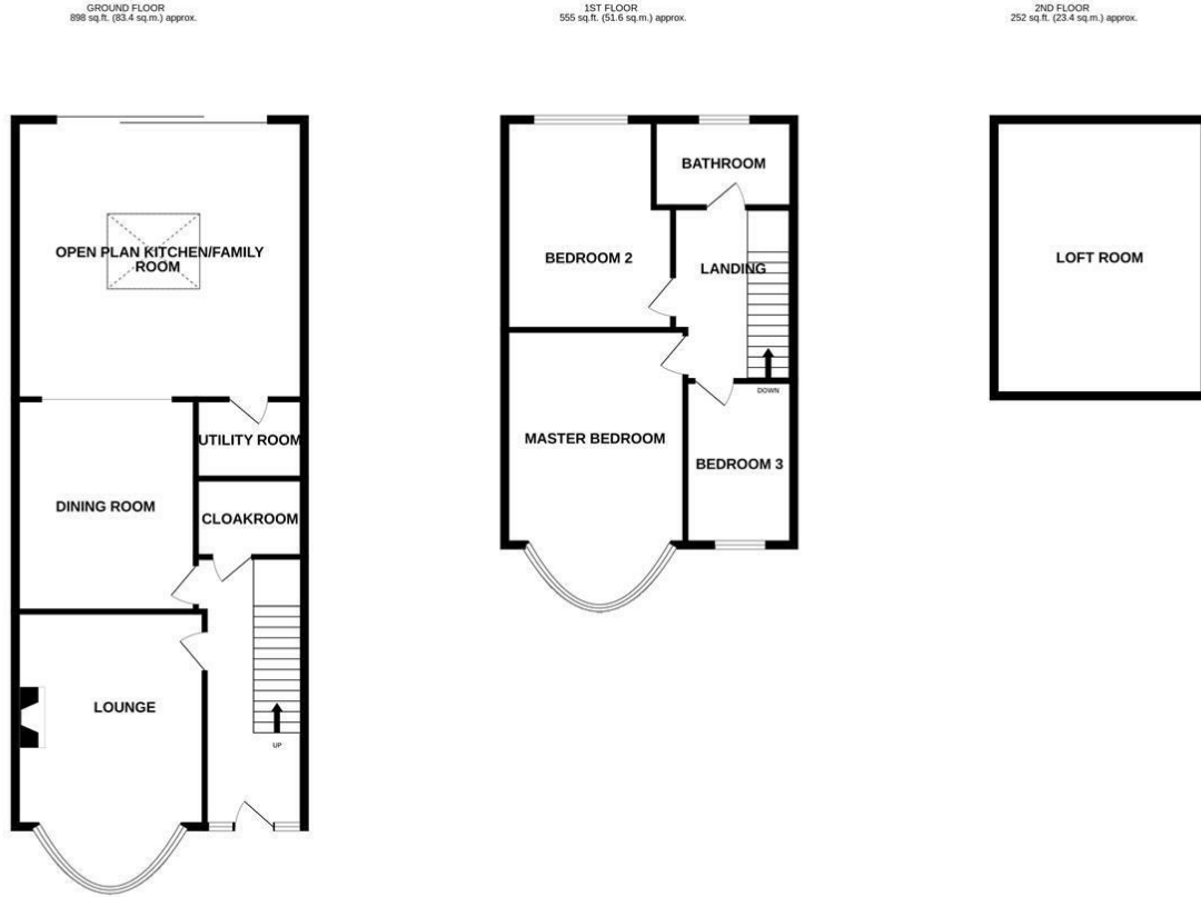
3 BEDROOM EOT HOUSE

TOTAL FLOOR AREA : 1706 sq.ft. (158.5 sq.m.) approx.