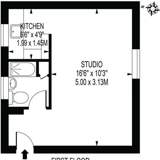
FIRST FLOOR FOR ILLUSTRATION PURPOSES ONLY

THIS FLOOR PLAN SHOULD BE USED AS A GENERAL OUTLINE FOR GUIDANCE ONLY AND DOES NOT CONSTITUTE IN WHOLE OR IN PART AN OFFER OR CONTRACT. ANY INTENDING PURCHASER OR LESSEE SHOULD SATISFY THEMSELVES BY INSPECTION, SEARCHES, ENQUIRIES AND FULL SURVEY AS TO THE CORRECTNESS OF EACH STATEMENT. ANY AREAS, MEASUREMENTS OR DISTANCES QUOTED ARE APPROXIMATE AND SHOULD NOT BE USED TO VALUE A PROPERTY OR BE THE BASIS OF ANY SALE OR LET.