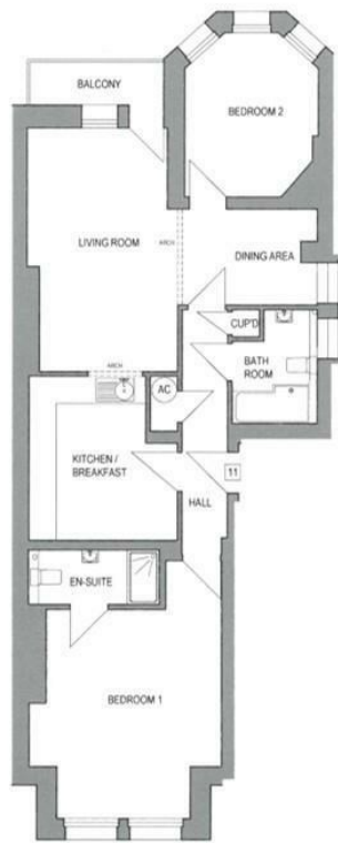
THIRD FLOOR Flat 11