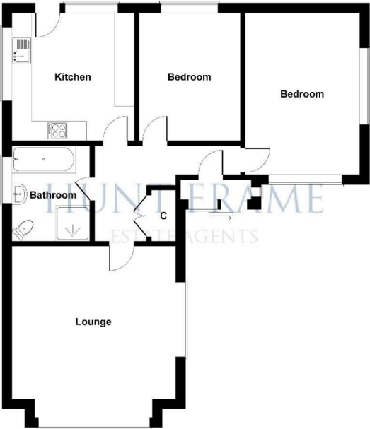
Not to Scale. Produced by The Plan Portal 2025 For Illustrative Purposes Only.