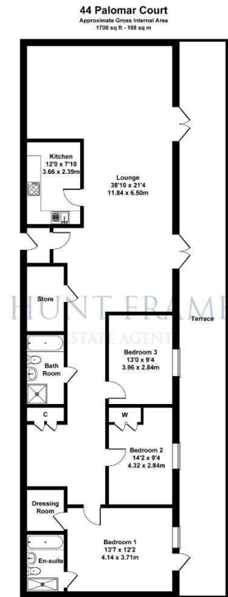
Not to Scale. Produced by The Plan Portal on behalf of Hunt Frame. For illustrative.