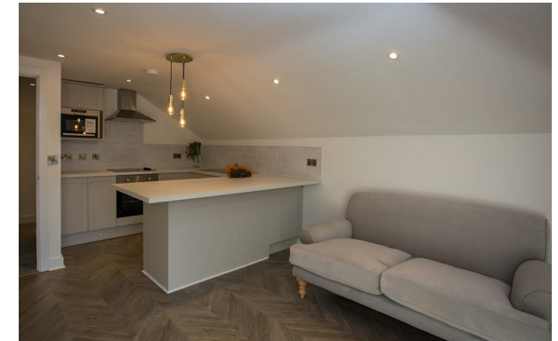
Apartment 11, Berkeley Court, Green Park Drive, Bennetthorpe, £775 PCM