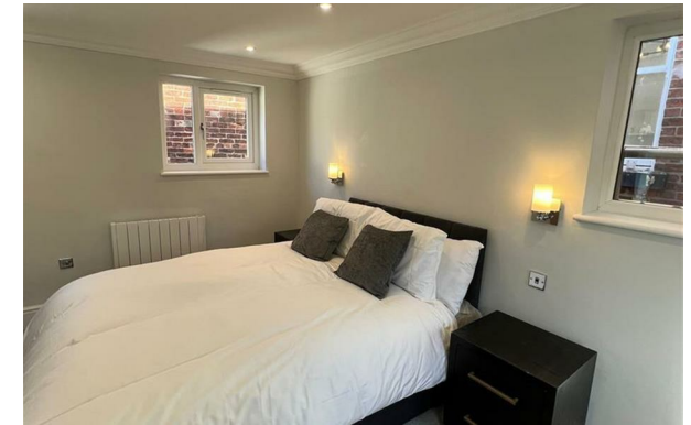
Apartment 3, 50 Hall Gate, York County House, Doncaster, £850 Per Month