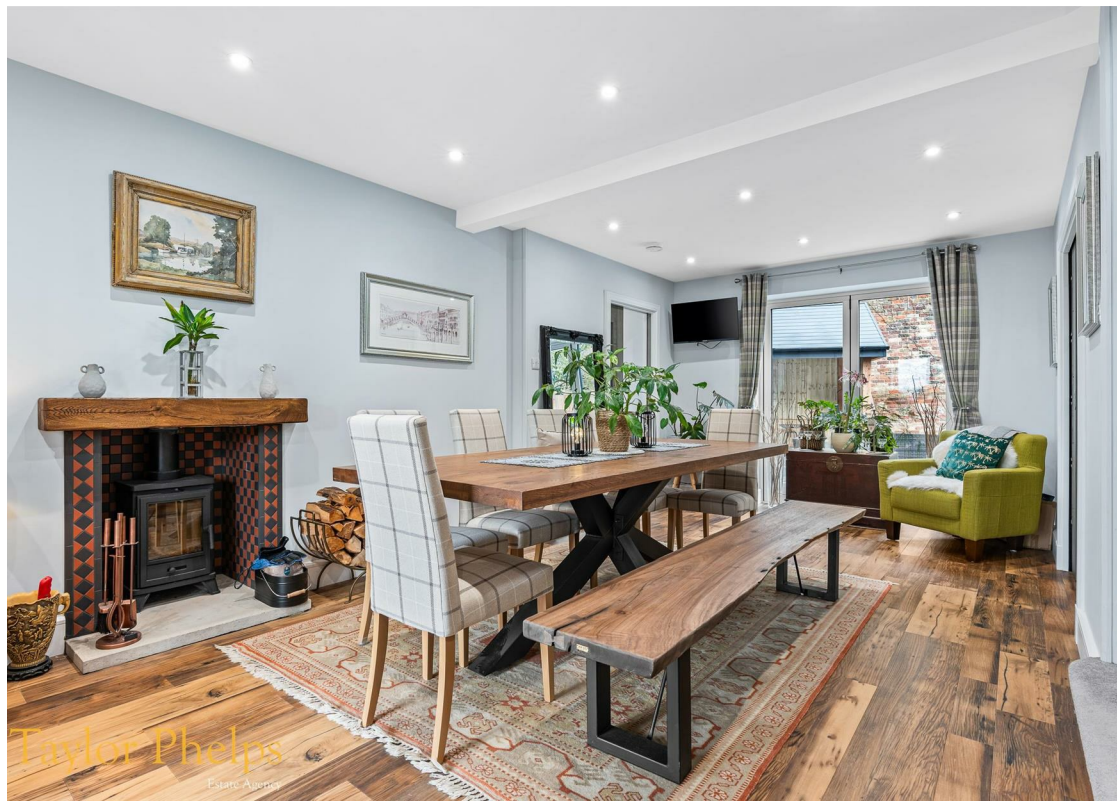
Taylor Phelps Estate Agency