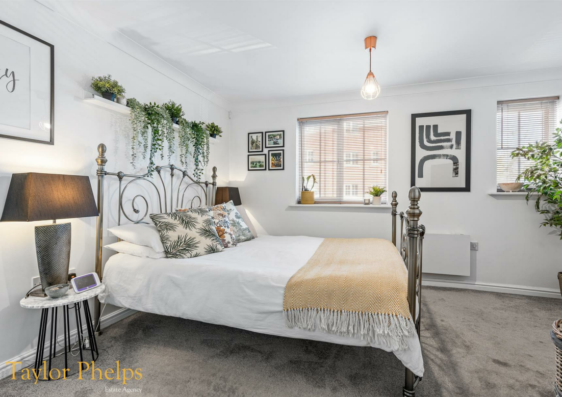
Taylor Phelps Estate Agency