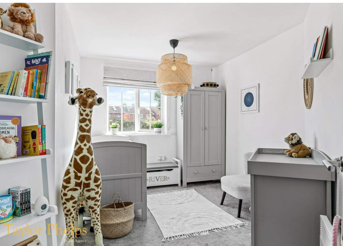
Taylor Phelps Estate Agency