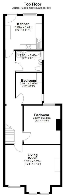
Total area: approx. 70.8 sq. metres (762.5 sq. feet)