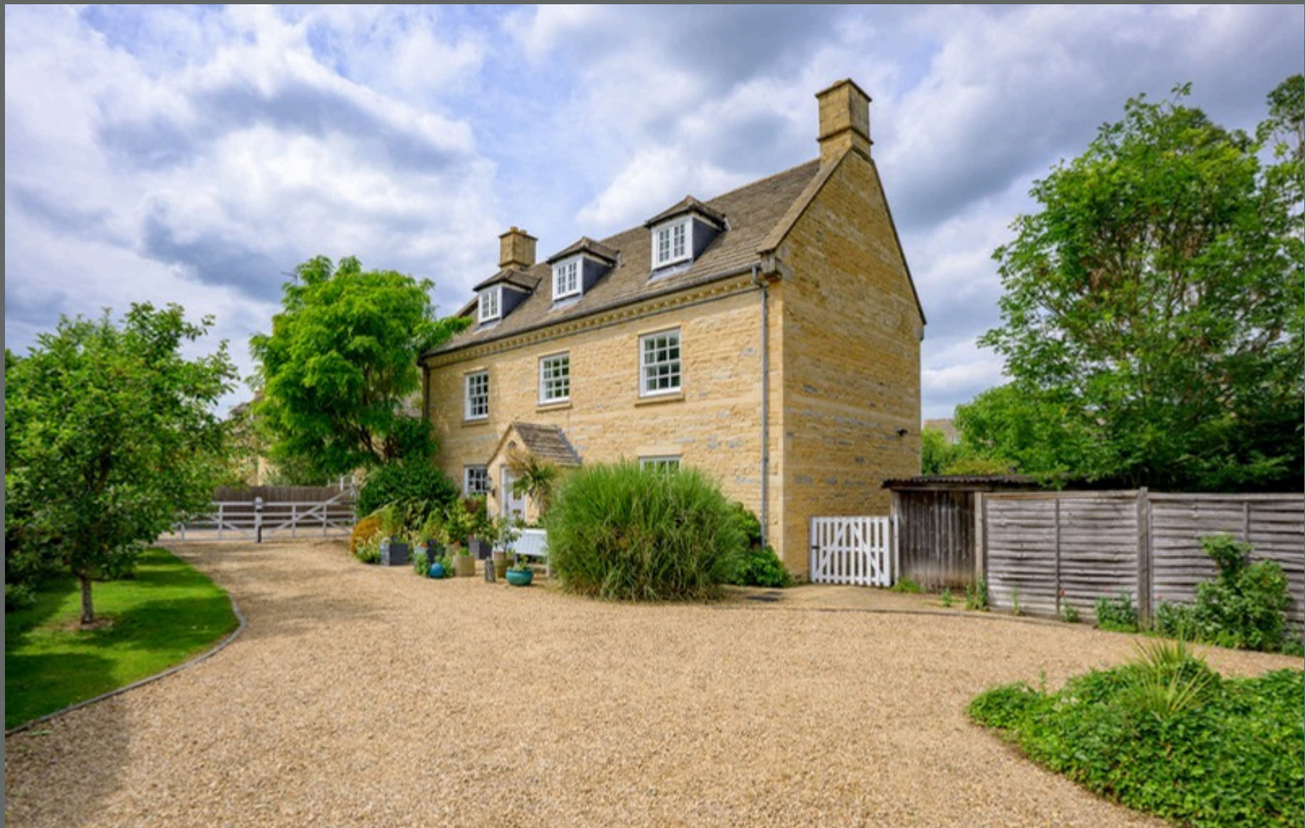
Orchard House Water Newton