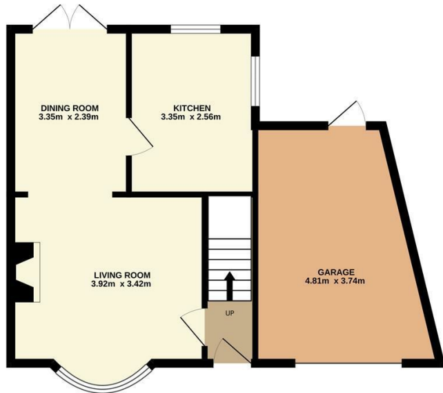
GROUND FLOOR 48.8 sq.m. approx.