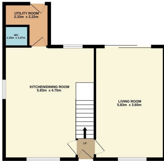
GROUND FLOOR 53.6 sq.m. approx.