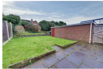
Front and rear garden