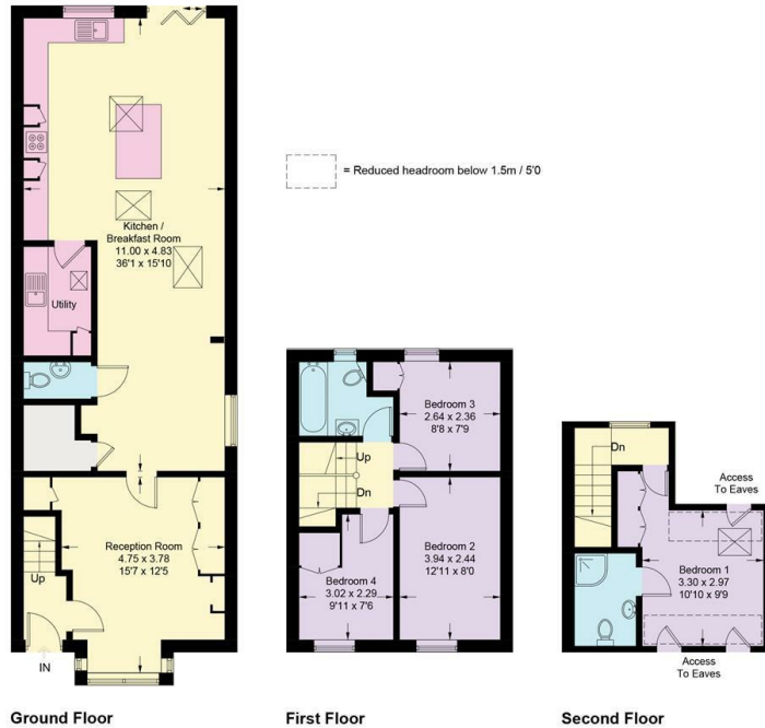
Illustration for identification purposes only, measurements are approximate, not to scale. Fourlabs.co © (ID1215973)