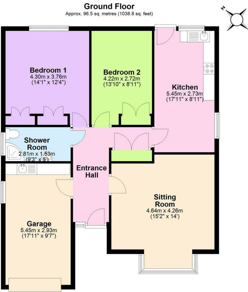
Total area: approx. 96.5 sq. metres (1038.8 sq. feet) 2 Kelston Close, Saltford