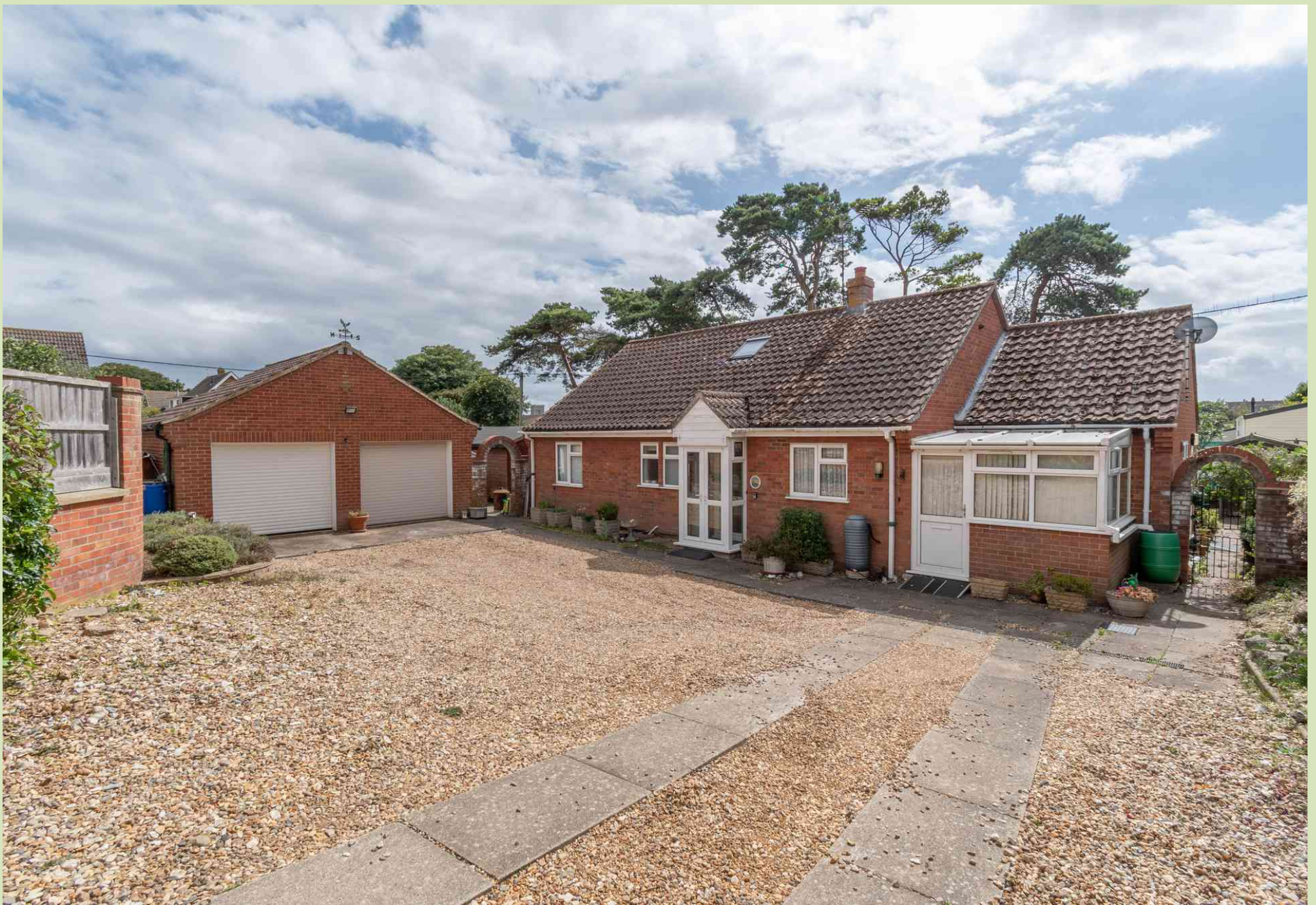
Burnsall, Wells-next-the-Sea Guide Price £585,000