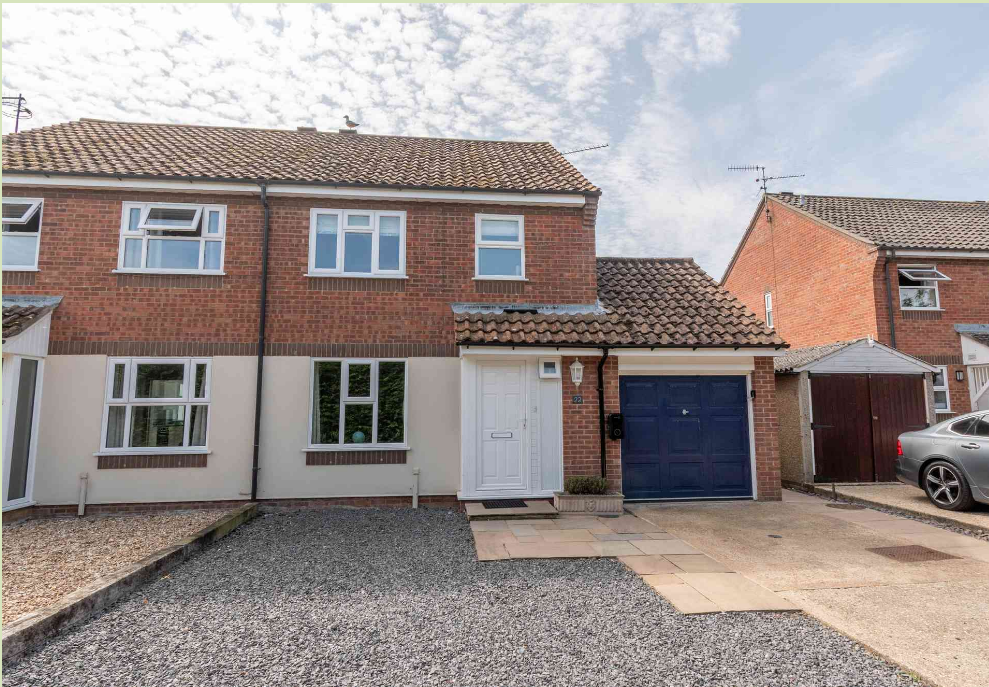
22 Bluebell Gardens, Wells-Next-the-Sea Guide Price £450,000