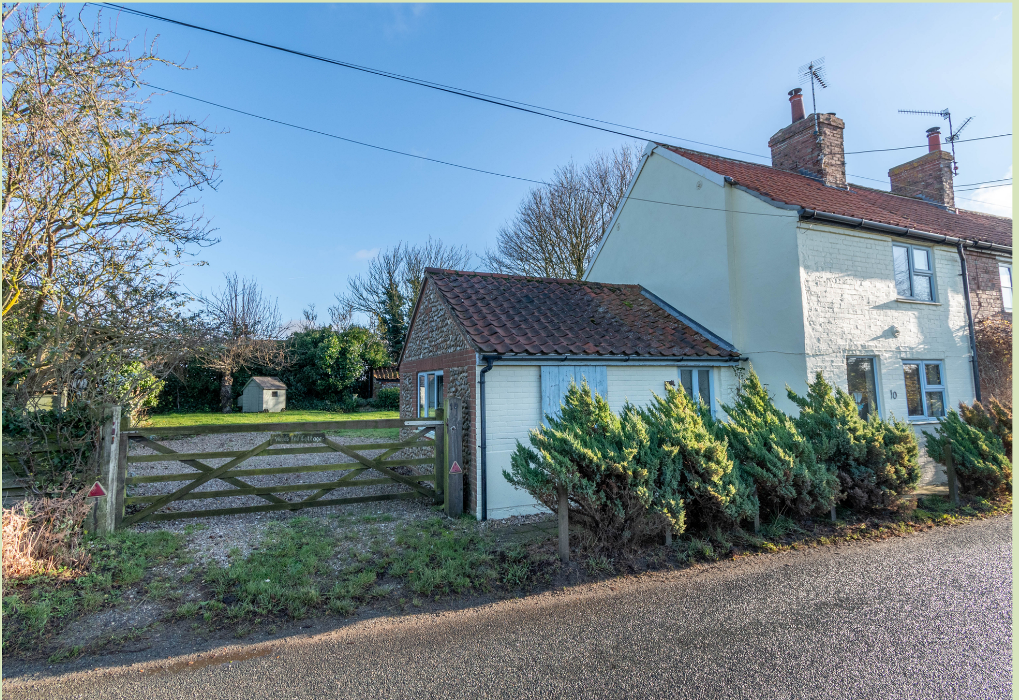
Woods End Cottage, Binham Guide Price £310,000