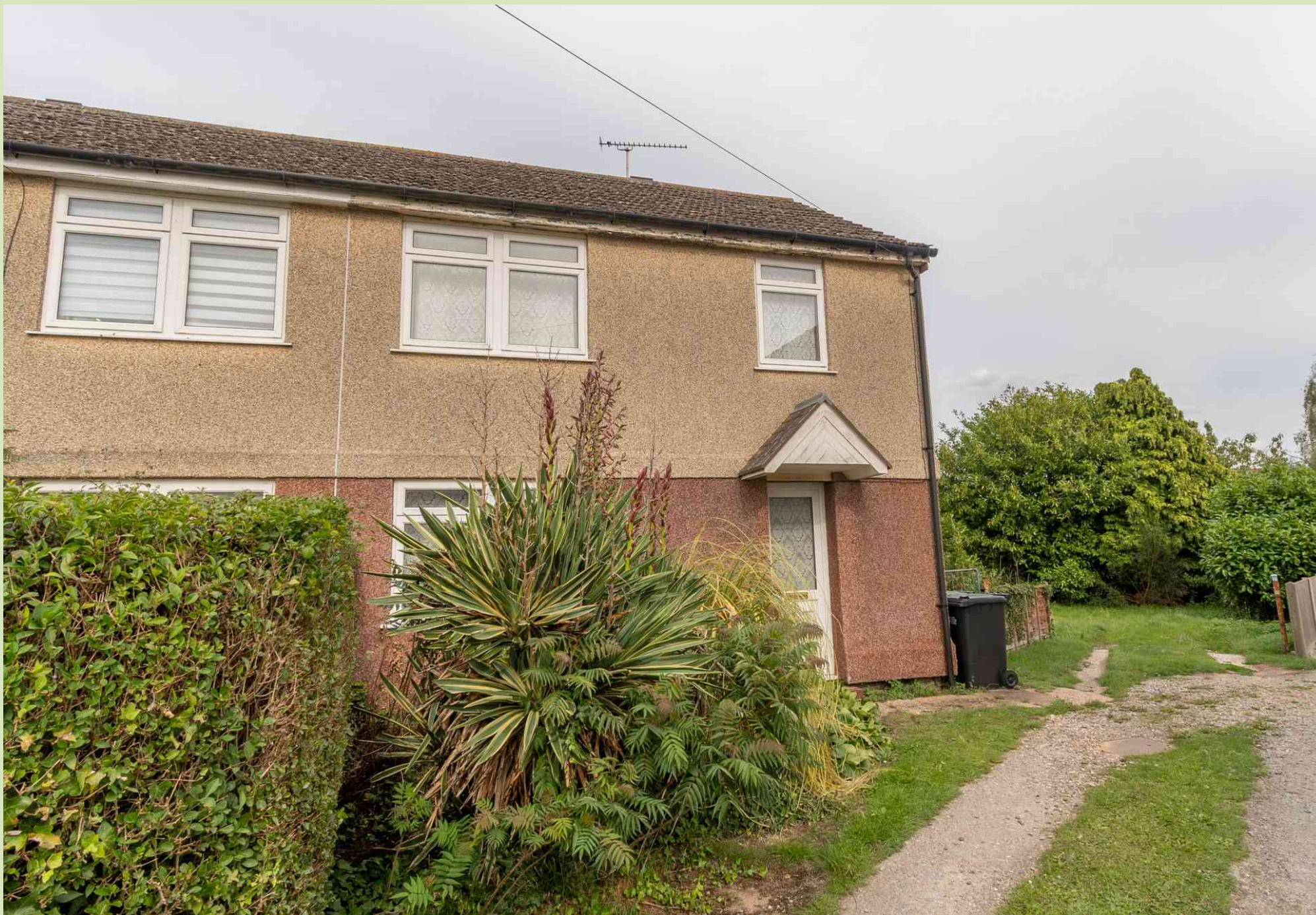
17 Elizabeth Crescent, Holt Guide Price £175,000