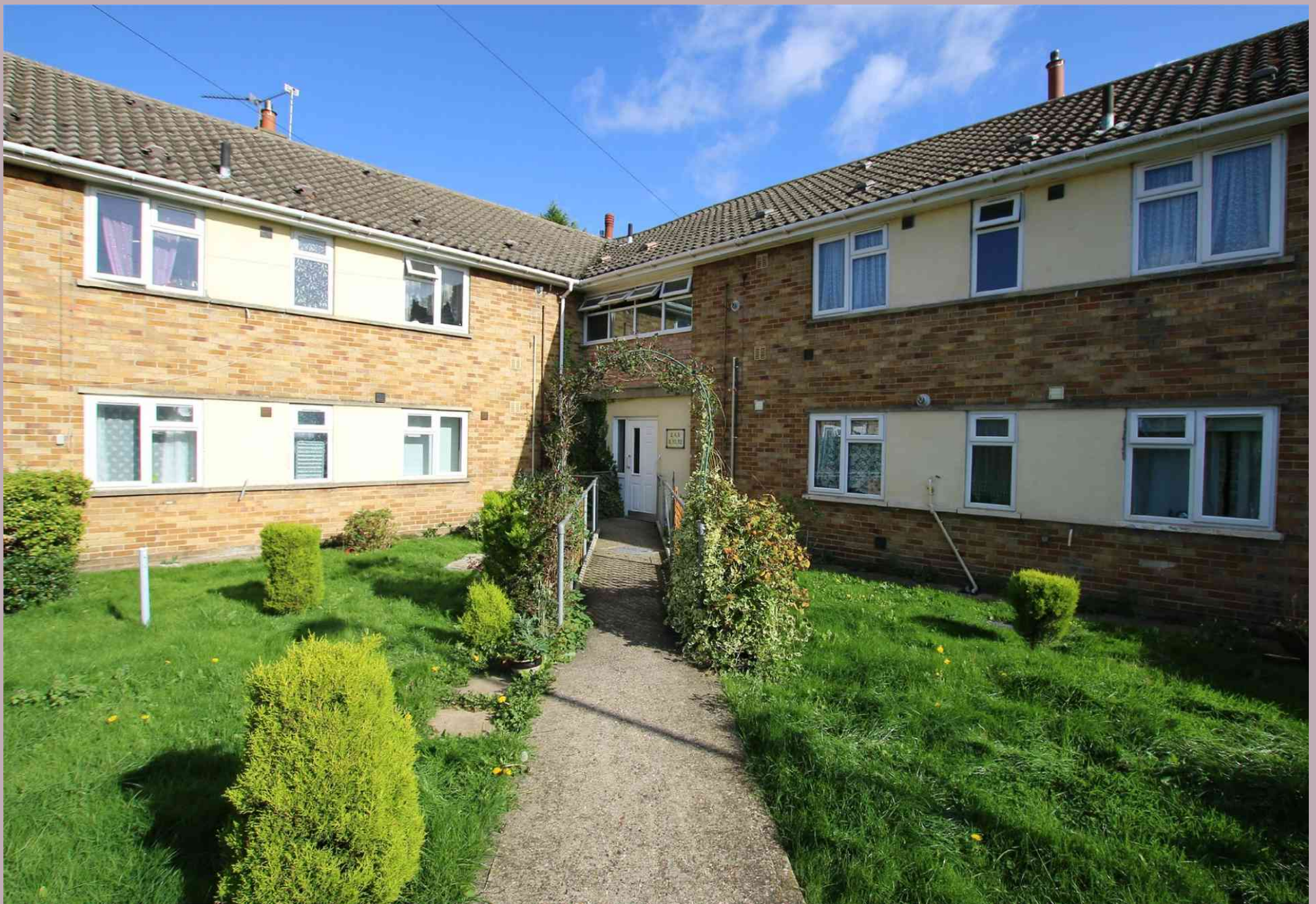
8 Anderson Close, King's Lynn £795 per calendar month