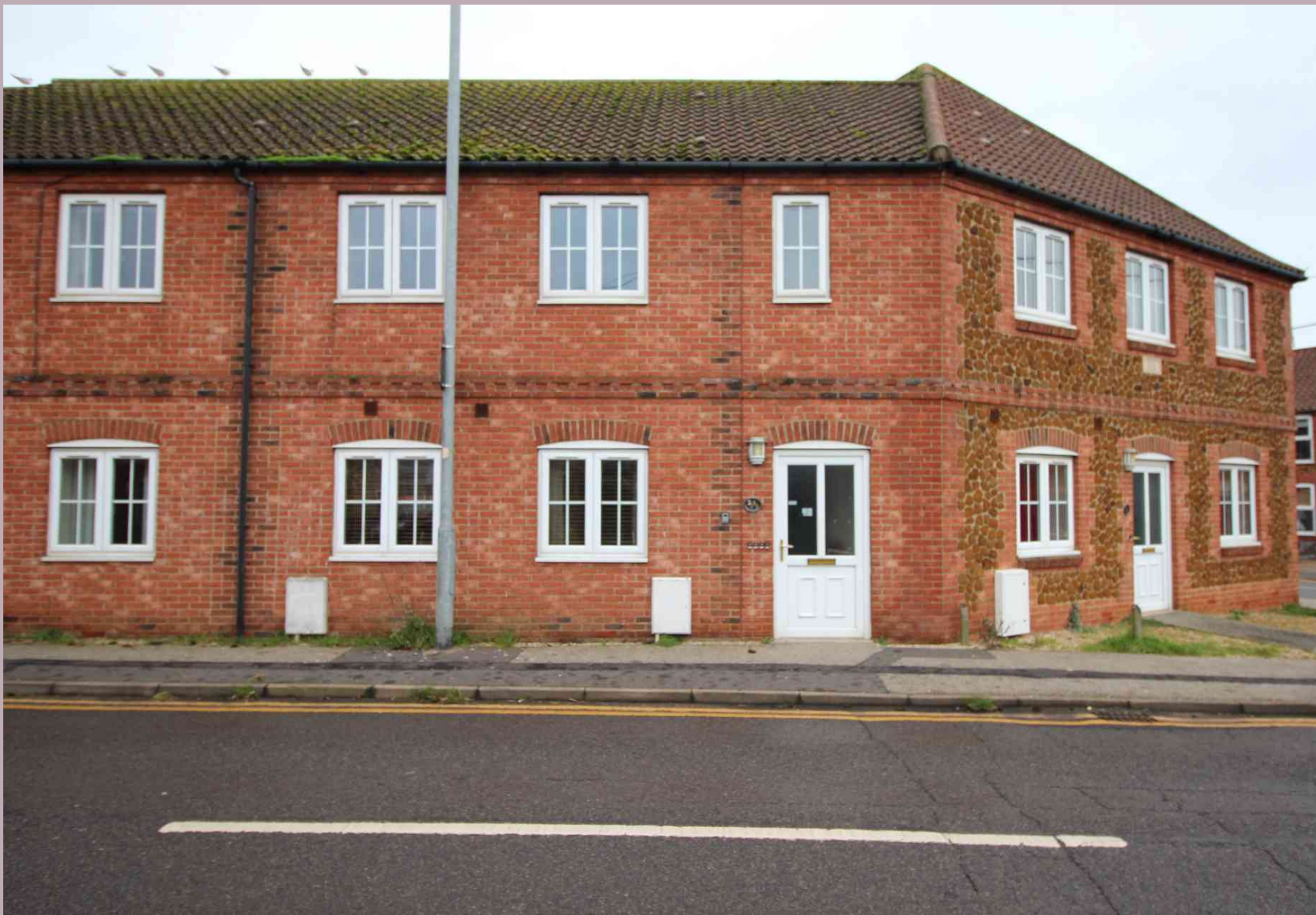
Flat 4 Chambers Court, Dersingham £725 per calendar month