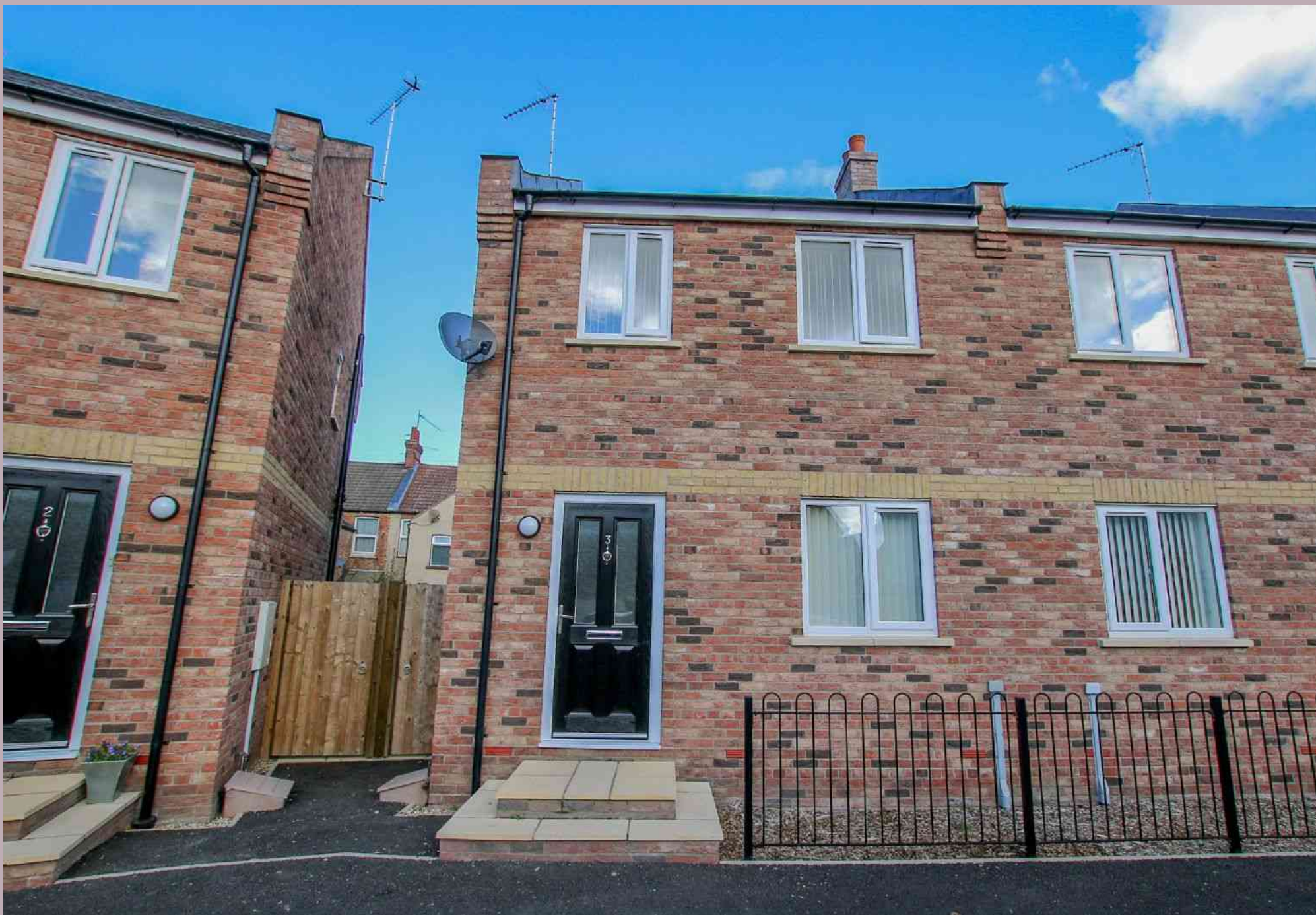
3 Eagle Yard Gaywood Road, King's Lynn £950 per calendar month