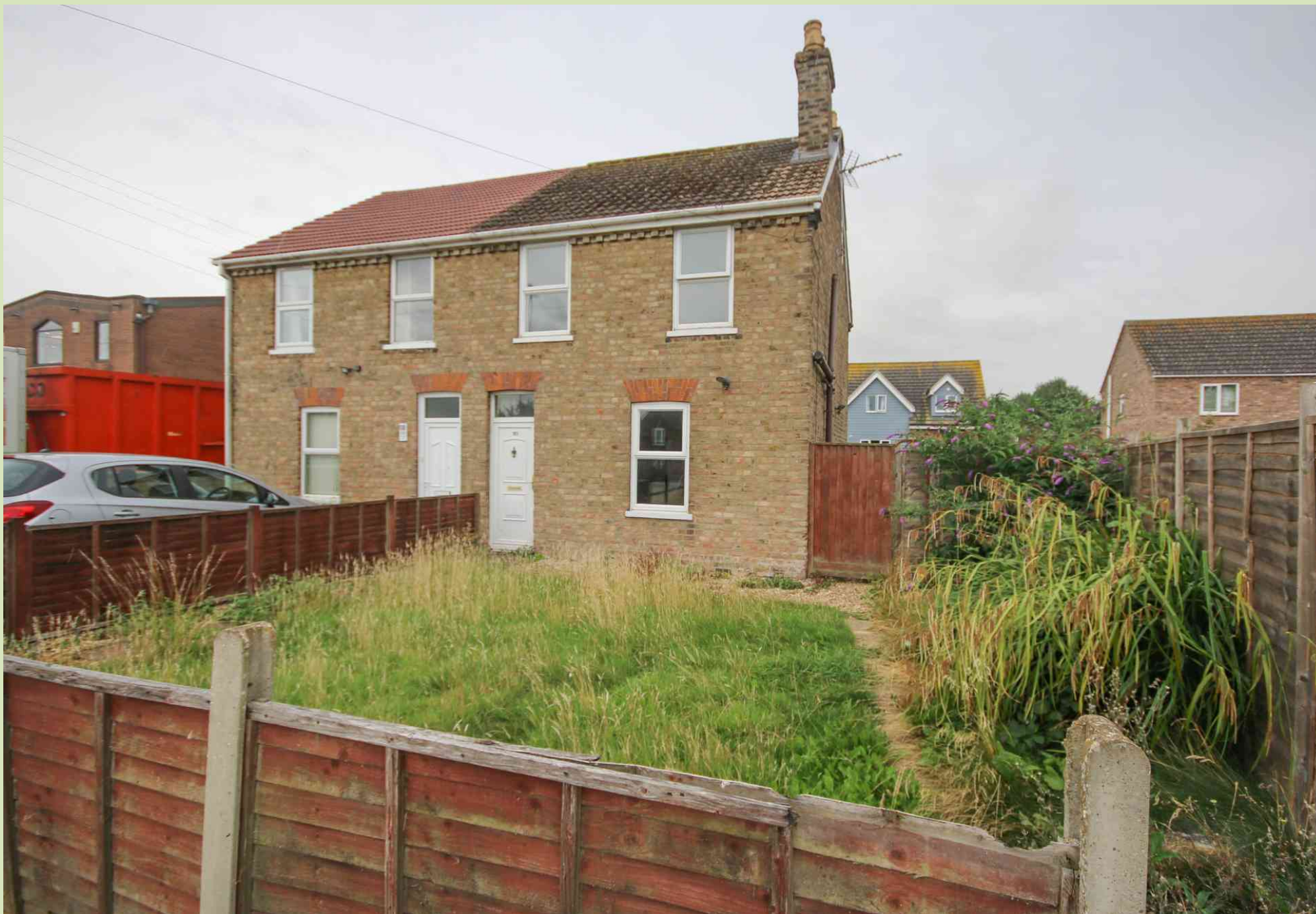
101 Bridge Road , Sutton Bridge Offers Over £160,000