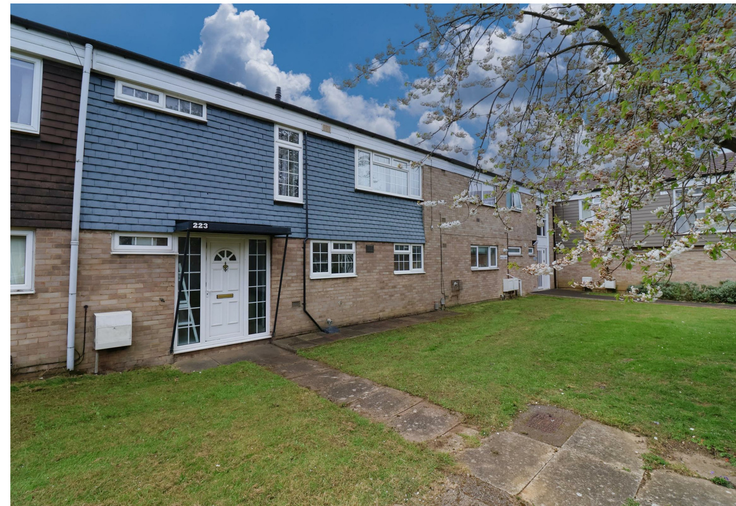
223 Jessop Road, Stevenage, SG1 5LR

Illustration for identification purposes only, measurements are approximate, not to scale.