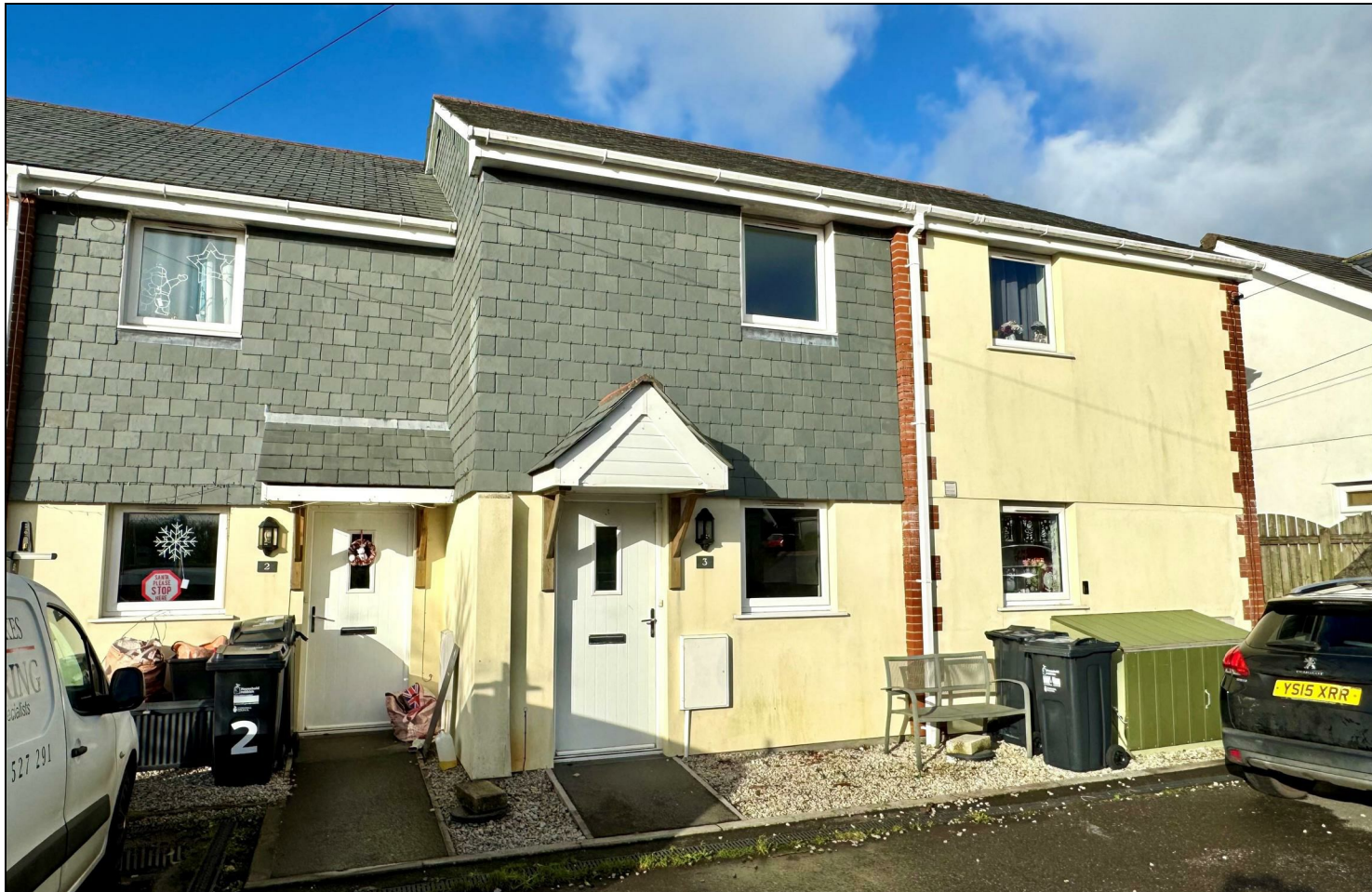
Mid-terrace 2 bedroom house in Fraddon.