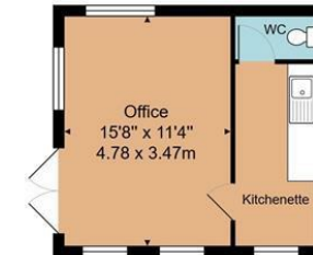
Office 15'8" x 11'4" 4.78 x 3.47m